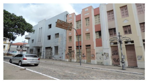
Figure 1. Casarios located in the Square Antenor Navarro - Rota Cidade Baixa (Lower City Route)

Some historical monuments are abandoned, being degraded with time, like the old IPHAN building in Praça Rio Branco, in Cidade Alta (Upper City), as well as graffiti on the houses, making them look ugly and dirty (Figure 1)