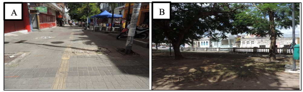
Figura 3. A) Calçadão da Rua Duque de Caxias - Rota Cidade Alta (Upper City Route). B) Improper disposal of solid waste at Venâncio Neiva Square (Tea Pavilion) – Rota Cidade Alta (Lower City Route)

Solid waste was another problem found, in some tourist attractions or even on the routes, it was observed the inappropriate disposal of solid waste (garbage) by squares and sidewalks, leaving the ugly look and dirty to the tourist or any passerby who passes by these places (Figure 3/B).