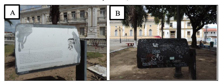
Figure 2. A) Plaque in the Square Venâncio Neiva - Pavilhão do Chá - Rota Cidade Alta (Upper City Route); B) Plaque in the Square Antenor Navarro - Rota Cidade Baixa (Lower City Route)

The tourist signs are almost all erased, rusty or depreciated, outdated and lacking translation into other languages. Therefore, this fact limits the tourist to obtain information and better use of the route (Figure 2)